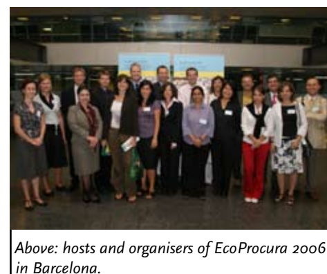
Above: hosts and organisers of EcoProcura 2006 in Barcelona.

The conference (usually a 2-3 day event) leaves the possibility open for organising pre-events and side-events to be held alongside, or as part of, the conference. For instance, the 7th EcoProcura conference could be combined with a Sustainable Product Exhibition or Business Forum and linked to other national initiatives. Read more about ICLEI's EcoProcura Conferences by visiting the website of the last Conference, held in September 2006 in Barcelona: www.iclei.org/itc/ecoprocura2006